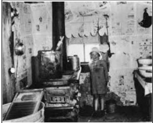
Daughter of a Sharecropper Standing in Newspapered Room of Their Home -Photographic Print by Carl Mydans

Western Citizen and newspaper walls – Two storyline threads join here: newspaper covering of the walls and abolitionist activity as indicated by the Western Citizen artifacts. It became evident during the recent open house that it is most convenient and logical to tell those stories together. We recommend providing an example of the newspaper covered walls in the southeast corner of the family room (203) room, rather than in the mud room (205) as previously discussed, so that this feature would be in sight of the Western Citizen remnant display. This