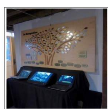
Soft-Opening Donor Recognition Display

Possible Lean-To Kitchen Door Presentation